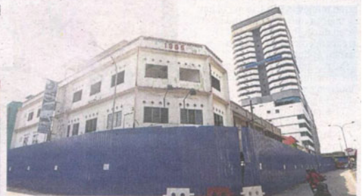
Old shophouses along Jalan Meru being demolished to make way for the LRT construction to better serve the community.

such as providing better service and ensuring public facilities and amenities were in good condition, he added.