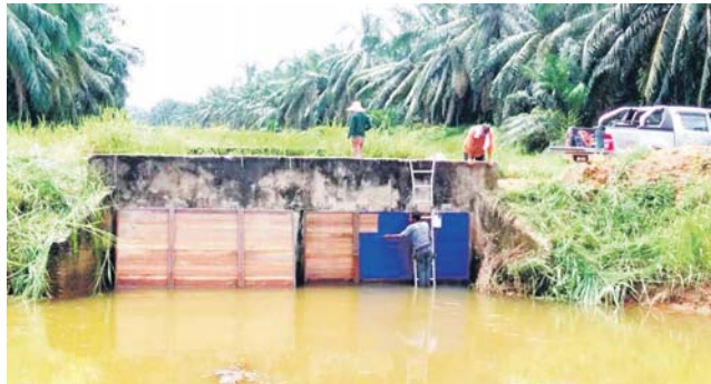
Pemasangan 'flap gate' menjadi penyelesaian jangka pendek untuk mengurangkan aliran air sungai masuk ke dalam kampung.

Alasan ketiadaan ketua kampung sebelum ini disebabkan pelantikan baharu juga menjadi isu berbangkit dikemukakan penduduk sehingga mengakibatkan isu