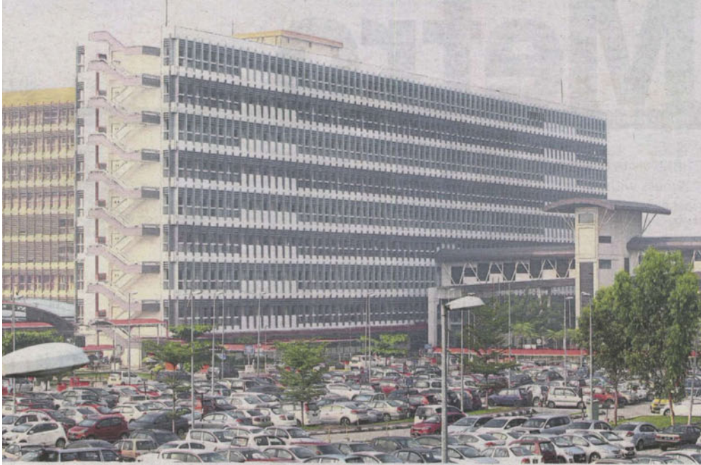
An LRT station at Hospital Tengku Ampuan Rahimah will be available to people in the future as its construction is ongoing along Jalan Langat.