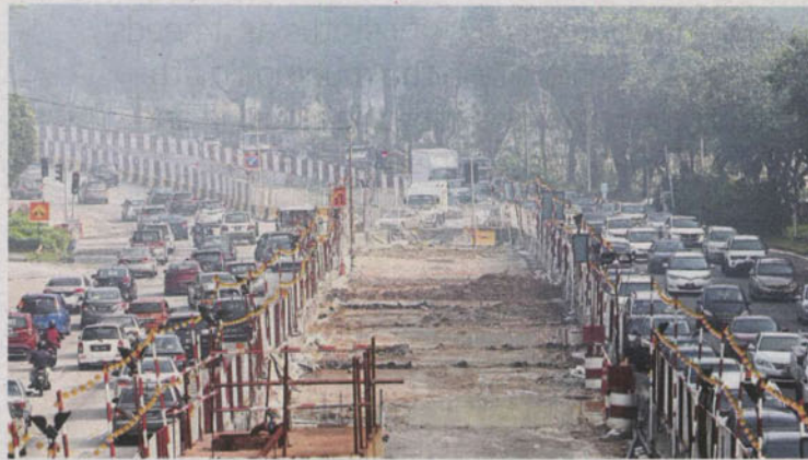
The ongoing LRT construction along Jalan Langat will benefit Klang's residents as it will improve the overall infrastructure in the municipality.

"I believe that MPK has already qualified as it has met the criteria