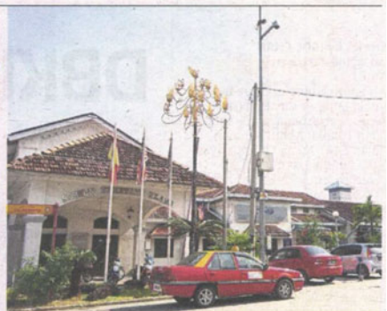
Klang KTM station located in one of the older parts of Klang is a popular spot here. This building is also in need of upgrading.