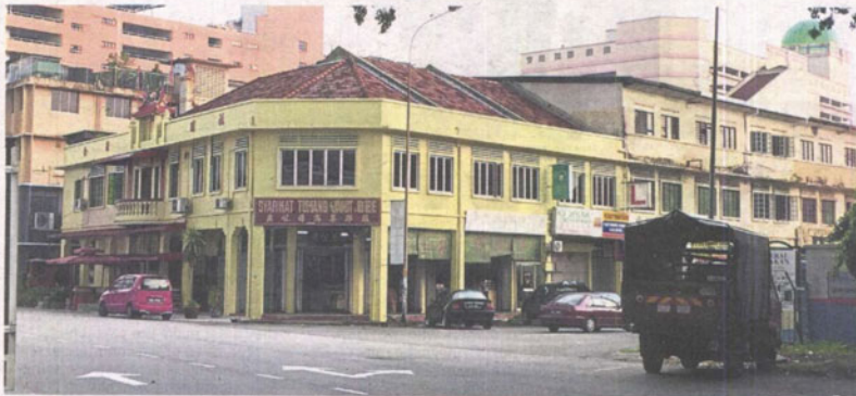
Old traders are still trading at these pre-war shophouses along Jalan Taiping, Klang.