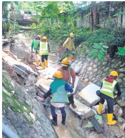
Keja pembersihan sedang giat dijalankan di lokasi kejadian.

"Sekiranya, penilaian lanjut mendapati kawasan tersebut tidak selamat, maka penduduk perlu tunggu