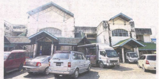
Pasar Besar Klang along Jalan Meru is in dire need of refurbishment.