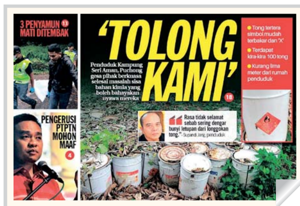
Muka hadapan Sinar Harian Ahad lalu.

JAS sedang mengenalpasti pemilik tanah dan pihak bertanggungjawab meninggalkan sisa berjadual tersebut yang berdepan tindakan di bawah Seksyen 34B(1)(a), Akta Kualiti Alam Sekeliling 1974 boleh dihukum penjara selama tempoh tidak melebihi lima tahun dan denda tidak melebihi RM500,000 jika disabitkan salah.