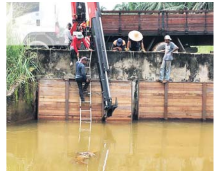
JPS akan meminta kerajaan negeri dan pusat mengutamakan Kuala Selangor untuk kerja penyelenggaraan.