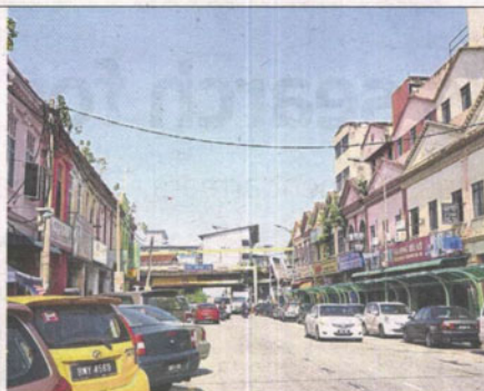
Old shophouses are a common feature in most parts of Klang's town centre.