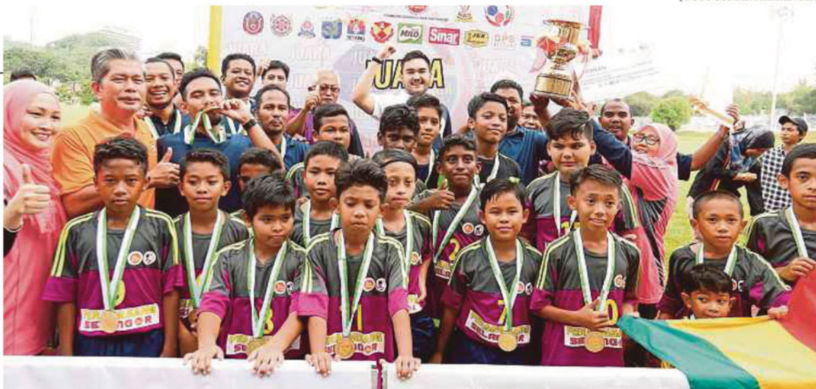
Tengku Amir Shah bersama pasukan SK Seri Selangor yang menjuarai Piala Raja Muda Selangor di Padang SUK, Shah Alam, petang semalam.